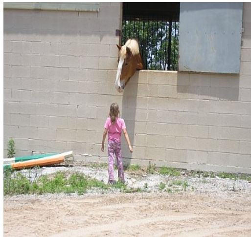
Jesse's House girls participate at Dream Power Horse Camp— Summer '07 *community youth pictured